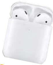
12-17 YRS PRIZE

OPEN A YOUTH ACCOUNT AND BE ENTERED TO WIN!!!