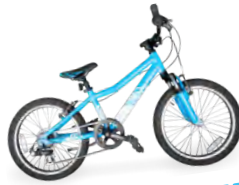
7-11 YRS PRIZE