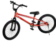
0-6 YRS PRIZE

April is National Credit Union Youth Month. It's a great time to celebrate the spirit of the credit union movement with our younger members and to plant the seeds of financial well-being. Help kids understand the importance of saving and developing good financial habits. Together, let's Unleash the Power of Saving at Your Credit Union!